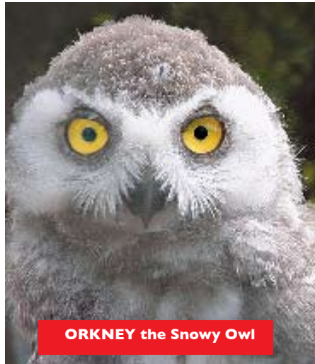
ORKNEY the Snowy Owl