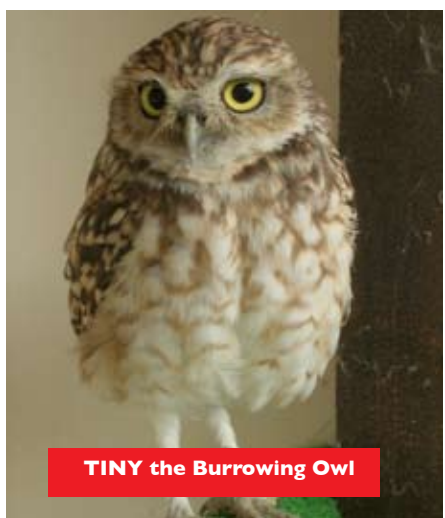
TINY the Burrowing Owl