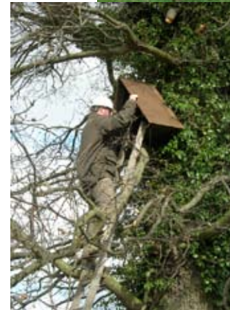
'Hard Hat Dean' manfully secures a gable box in a mature tree in a secluded location