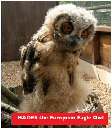
HADES the European Eagle Owl

The last few months have seen a number of new arrivals at the Suffolk Owl Sanctuary - all except Tiny born at our Suffolk headquarters. Most will play an important role as we inform, educate & entertain visitors and others who benefit from the demonstrations & talks we give on owl care & conservation.