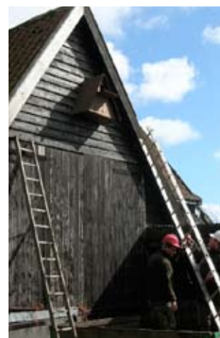
This barn presented the ideal location point for a new box, enabling us to locate it high enough to be out of harms way

Now, having successfully erected the boxes, it's worthwhile remembering that this is not, of course, the end of the story - only the beginning. It can take as much as three or more years before the owls decide to use a box - so those of you who undertake the task may have a long wait before seeing any results for their actions. Also, be certain you are aware that it is ILLEGAL to go near an owl nestbox without a "Disturbance License," which can only be obtained through the government agency DEFRA.