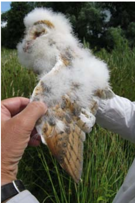
The team take great care when evaluating and ringing the young Barn Owl progeny

The Waveney & Gipping Valleys offer a vast region of suitable habitat for a