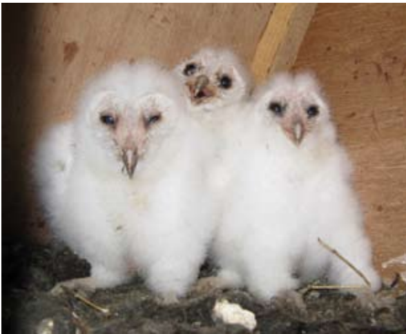
Box Camera - three baby Barn Owls populate a Waveney Owl box

Now in its eighth year, the Thornham Owl Project in East Anglia has conducted an annual survey of the number of owls and other birds of prey that have successfully bred in the approximately 200 nest boxes they have strategically placed around the Waveney & Gipping Valleys in Mid Suffolk and South Norfolk.