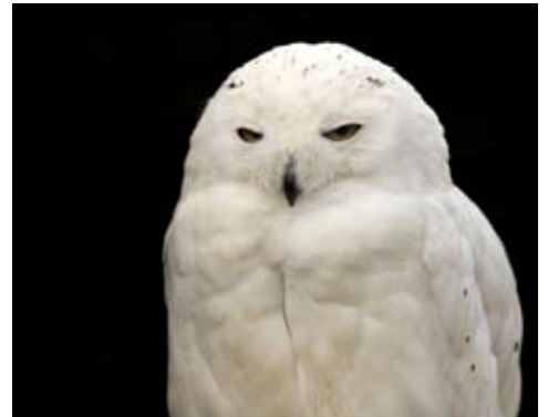
The astounding Snowy Owl can survive in temperatures of -40°C - thankfully this ability was not tested at the Sanctuary (though it sometimes felt like it!)

The Centre itself lay quietly under a thick blanket of snow for a few days - and as a result of all the snow gradually turned to a thick blanket of ice, so in the interests of health and safety, we had no choice but to remain closed to the public for a few days and wait it out! That said, I'm not sure many people contemplated a visit in those temperatures anyway!