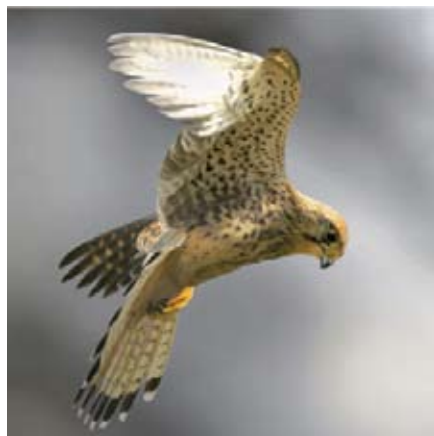
In fine fettle - hopefully the injured Kestrel we received recently will be back in the air soon

A couple of weeks afterwards we received a Kestrel from a local vet, the bird having been found by a woman on her outside patio, having believably crashed into the window. Having been given a thorough examination by the